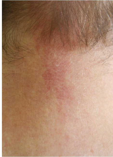
FIGURE 4–3. Port-wine stain is a vascular anomaly often located on the back of the neck. This individual has a port-wine stain extending from the base of the neck, well into the skin of the scalp. Port-wine stains often fade or diminish in size over time.

neck for port-wine stains, freckles, moles, or depigmented areas of skin in otherwise normally pigmented skin. Observe the patient's hair for white or silver hair in otherwise dark hair, or for uniformly silver or very white hair.