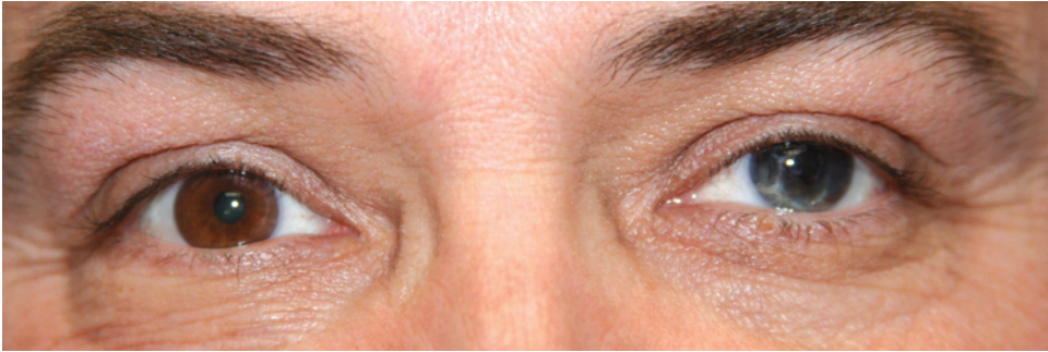
FIGURE 4–4. Eye trauma can sometimes approximate the appearance of heterochromia iridis. The eye on the left has lost brown pigment because of a traumatic accident in this man's childhood. His normal eye is brown.

this condition causes eye pain when the eye is exposed to strong sunlight. Corrective surgery or protective contact lenses may be needed to treat the problem. Patients remember eye trauma. Always ask the patient about the cause of an anomaly before assuming that it is genetic.